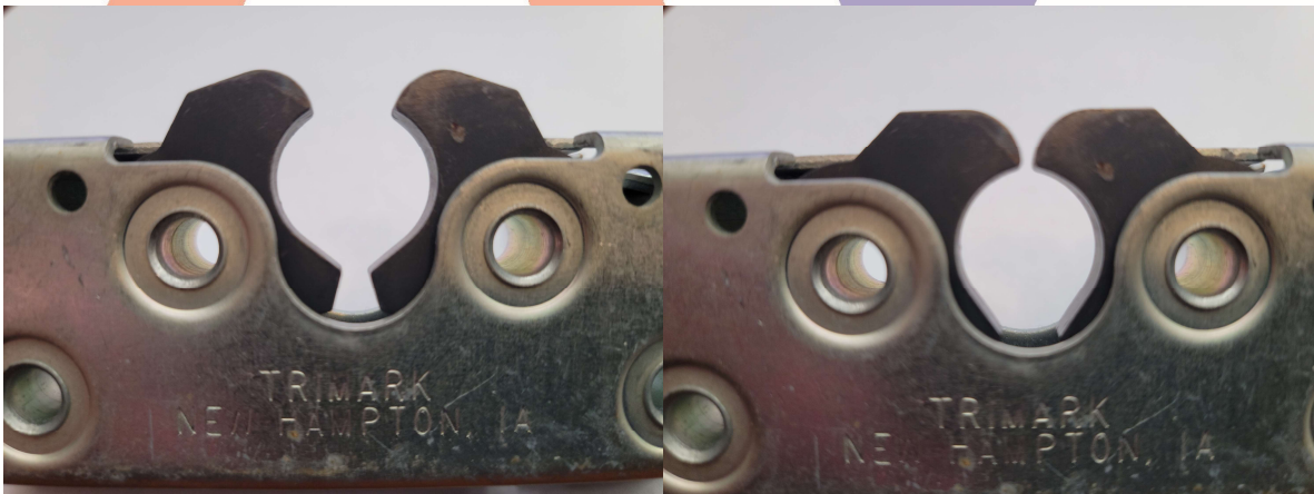
Figure 3: Incorrect 1st Latch Position