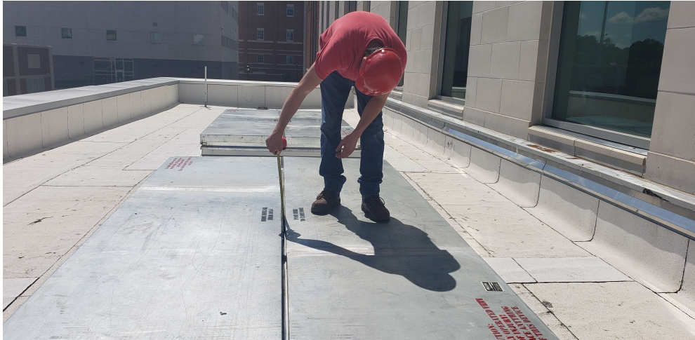
Figure 5: Measurement Location