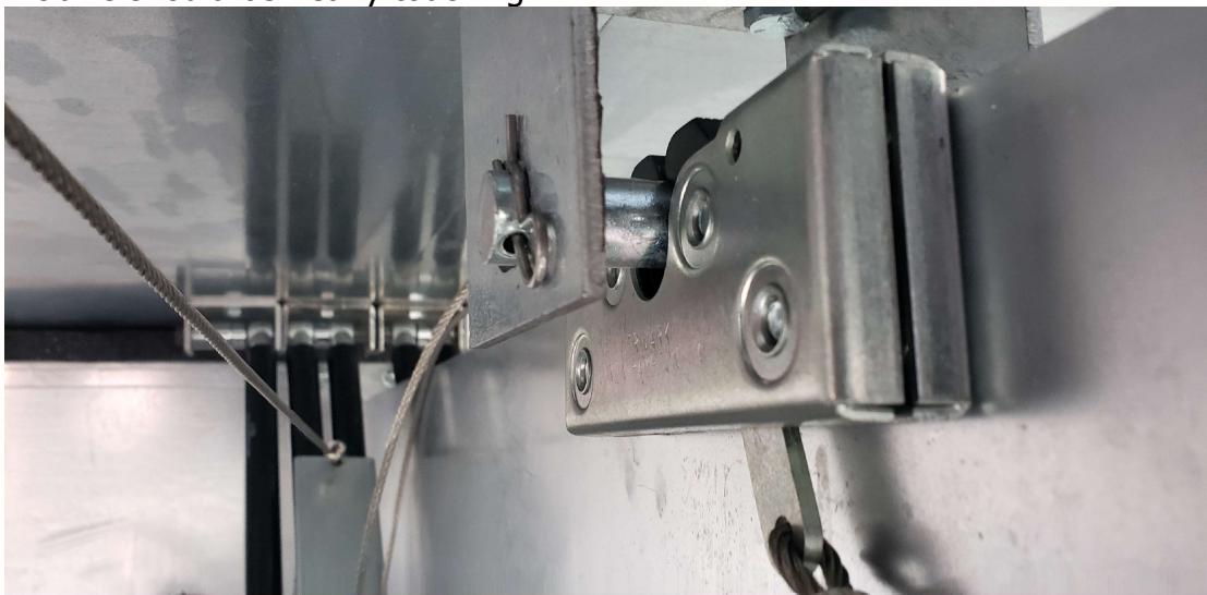
Figure 2: Second Latch Position Installed