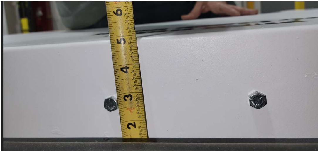
Figure 7: STC-50 Latch Position Measurement