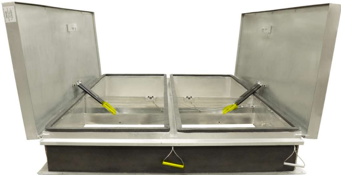
Figure 1: Hold Open Channel Release Handle location